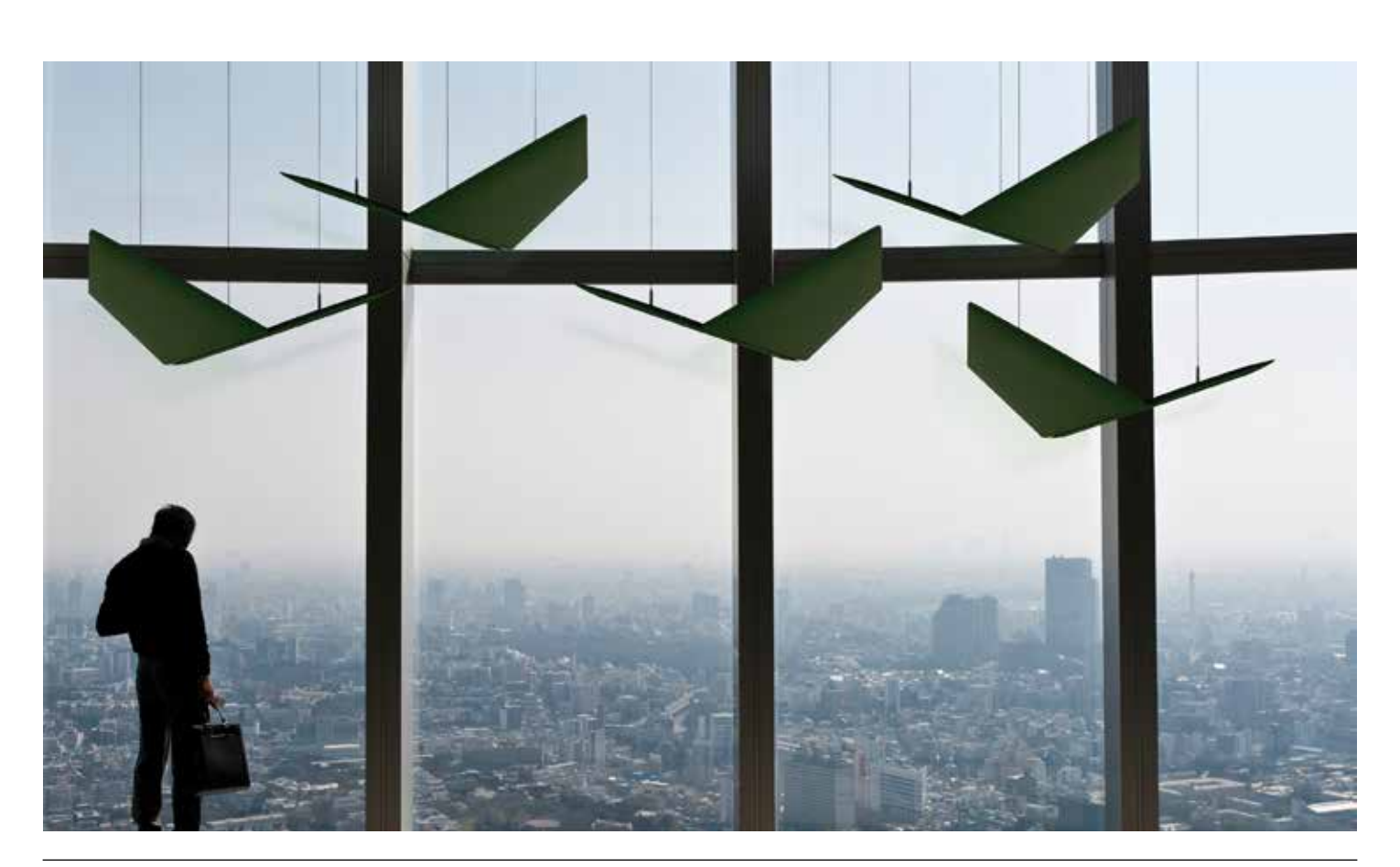
Caimi Brevetti S.p.A. reserves, by its unappealable judgment, the right to modify without prior notice the building materials, the technical and aesthetic specifications, as well as the dimensions of the products in this technical sheet, where pictures are purely as an indication.