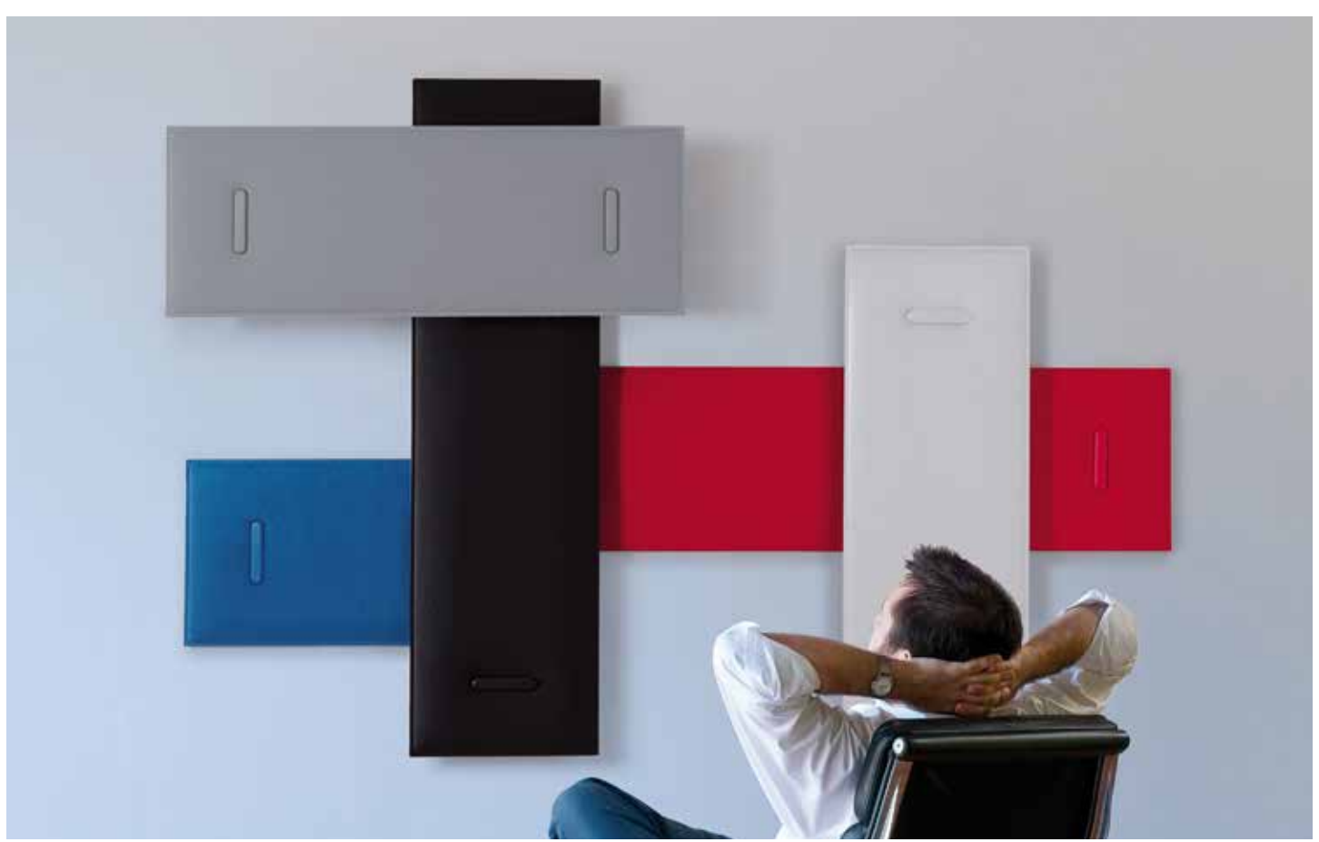
Caimi Brevetti S.p.A. reserves, by its unappealable judgment, the right to modify without prior notice the building materials, the technical and aesthetic specifications, as well as the dimensions of the products in this technical sheet, where pictures are purely as an indication.